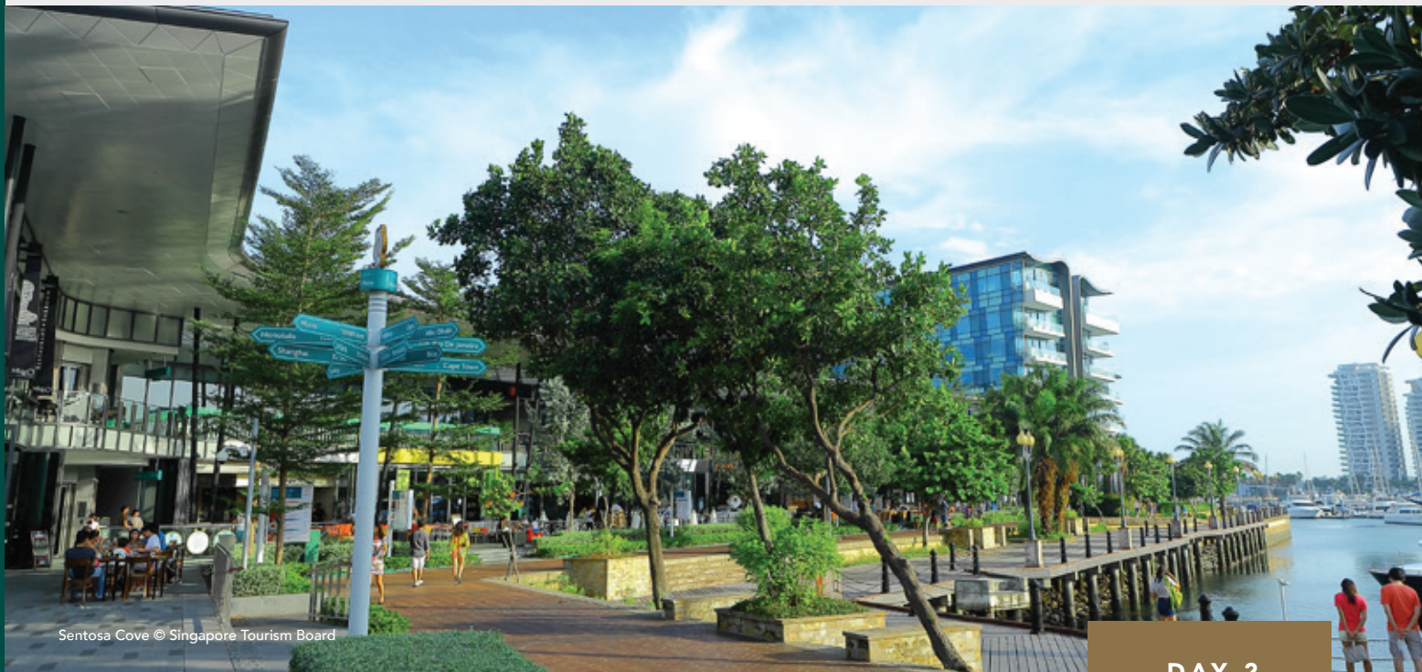
Sentosa Cove