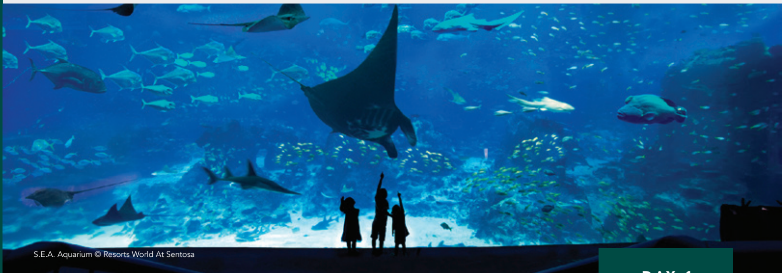
S.E.A. Aquarium

Make the most of Singapore's breezy dry season with a host of outdoor escapades and watery adventures.